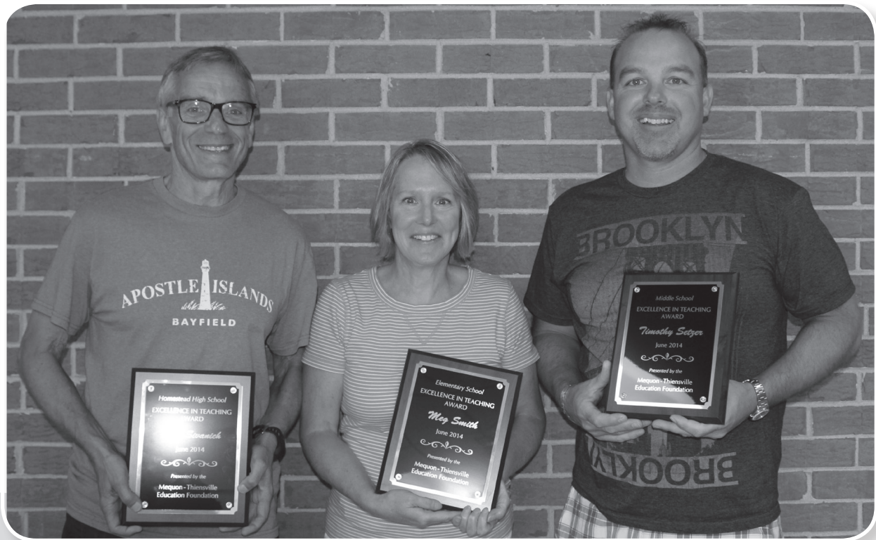
2014 Excellence in Teaching Award winners – (from left to right)